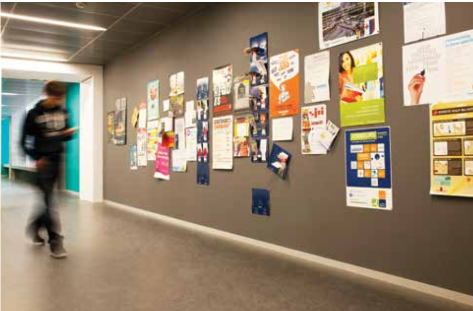
Artevelde Hogeschool Product: Marmoleum Bulletin Board