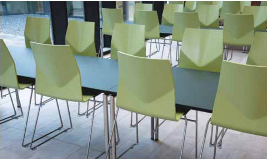
Egedal Town Hall Product: Furniture Linoleum

The Egedal Town Hall is designed for administrative environments in open offices. The inherent risk of noise was solved by applying Furniture Linoleum on the desks, as it has acoustic reduction properties. "Desktop linoleum is an excellent material with a soft surface that really helps to reduce extraneous noise. On top of that it's antibacterial." Rikke Holm, Interior architect, H+ ARKITEKTER.