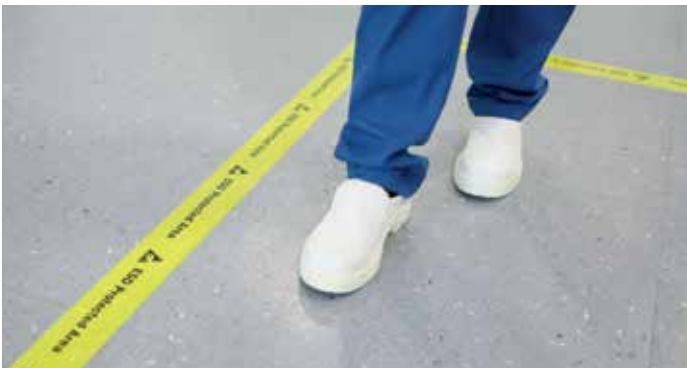
RENEX Electronics Product: Colorex EC plus

The headquarters of Brainlab is located in Munich, Germany. Brainlab is a software-company that specialises in applications for the medical sector. Two colours of Colorex SD flooring have been used in the main areas. In the corridors and reception area Eternal digitally printed vinyl has been installed.