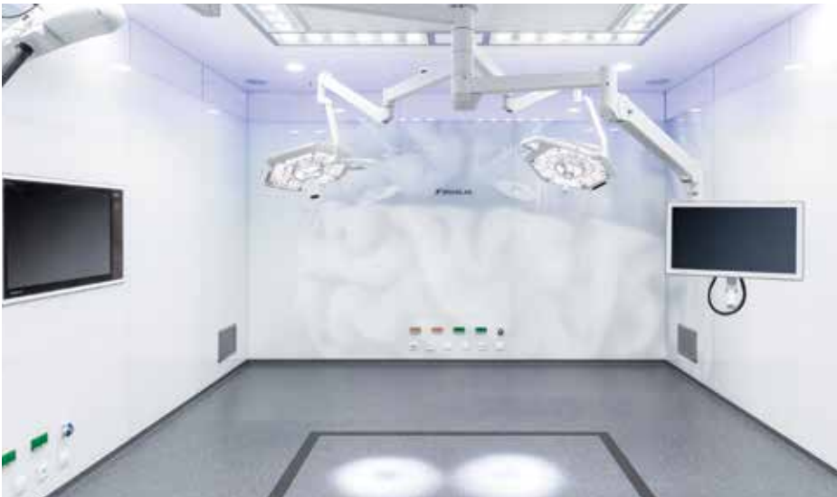
BRAINLAB Munich Product: Colorex, Eternal

The headquarters of Brainlab is located in Munich, Germany. Brainlab is a software-company that specialises in applications for the medical sector. Two colours of Colorex SD flooring have been used in the main areas. In the corridors and reception area Eternal digitally printed vinyl has been installed.