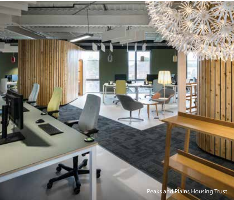
Peaks and Plains Housing Trust

For more information on our floor finishes that work together, please visit www.forbo-flooring.co.uk/government