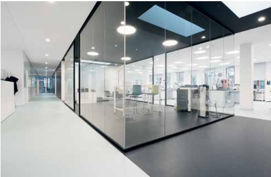
Unisensor Laboratories Products: Sphera Element, Colorex SD static control flooring